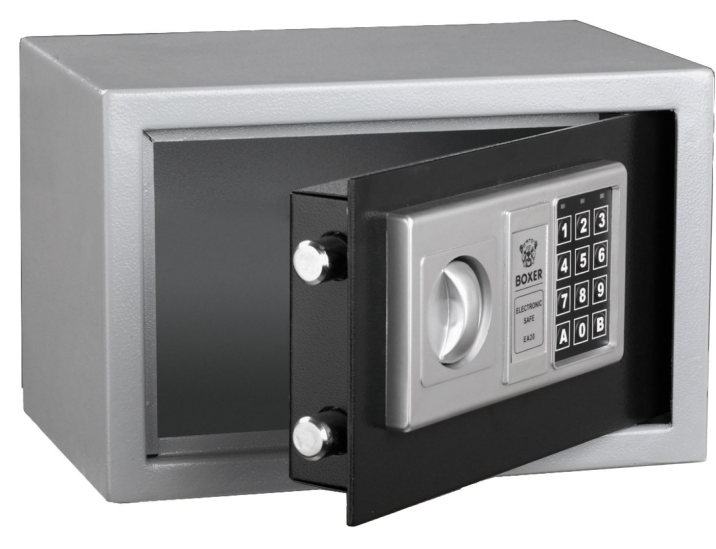
Pictures shown have only an illustrative purpose, they dont qualify for contractual terms